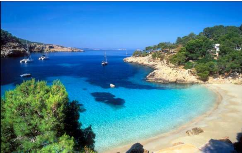
AS SEEN BY US