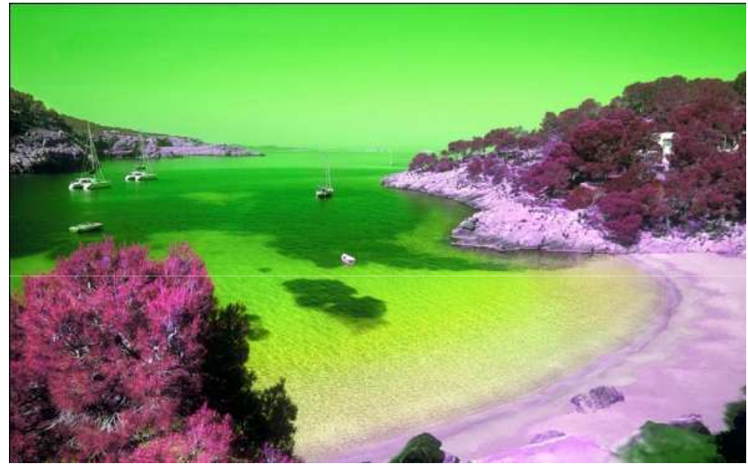
AS SEEN BY THE NURSERY CHILD